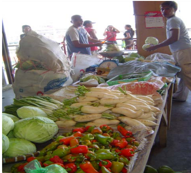
Traditional Market - Traders