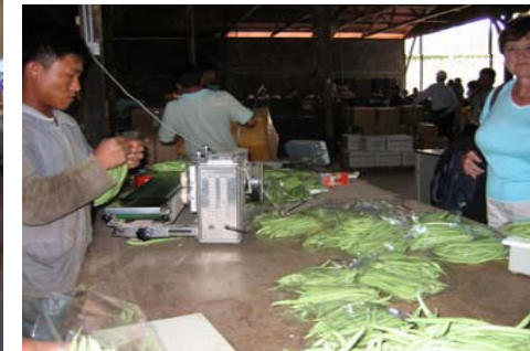
Modern, dynamic market chains